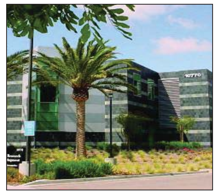
■ Figure 3. There you see it, here you don't. To comply with local ordinances governing roofline aesthetics, the mixed-flow impeller systems are mounted inside the building of this pharmaceutical manufacturer.

using methods approved by the American Society of Heating. Refrigeration, and Air Conditioning Engineers (ASHRAE) (1) or computer programs such as the EPA's SCREEN3, AERMOD or ISCST3/ISCPRIME models (www.epa.gov).